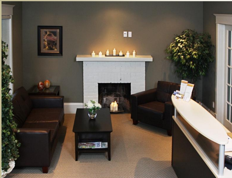
HHC Reception Area